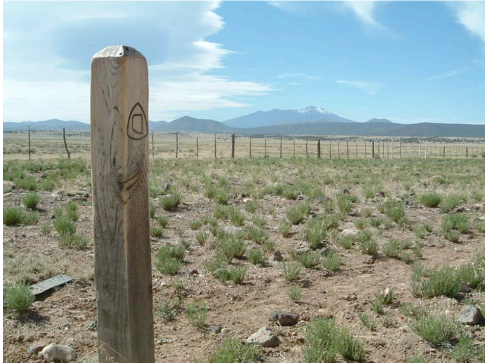
AZ Trail historic wooden posts