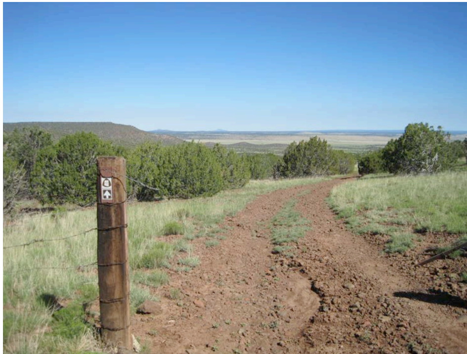
AZ Trail carsonite on fence posts