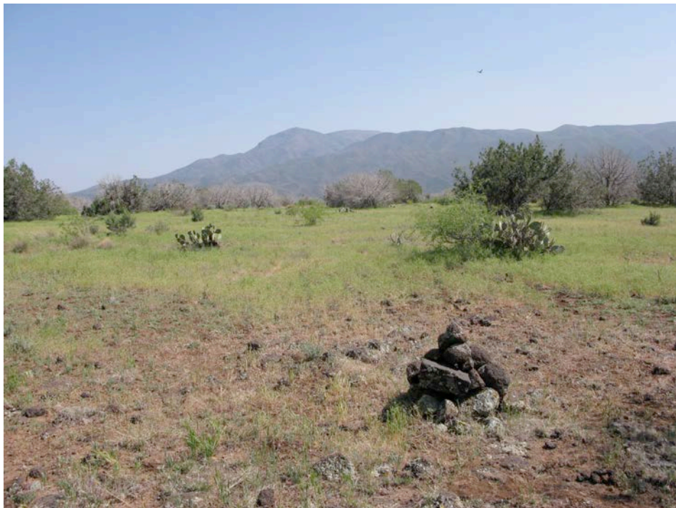
AZ Trail rock cairns