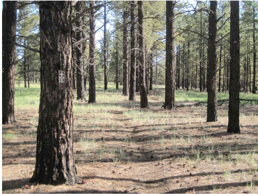
AZ Trail carsonite on trees