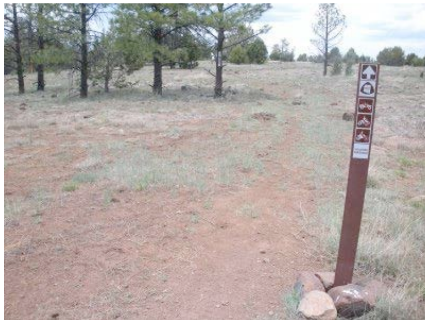
Arizona Trail brown carsonite posts