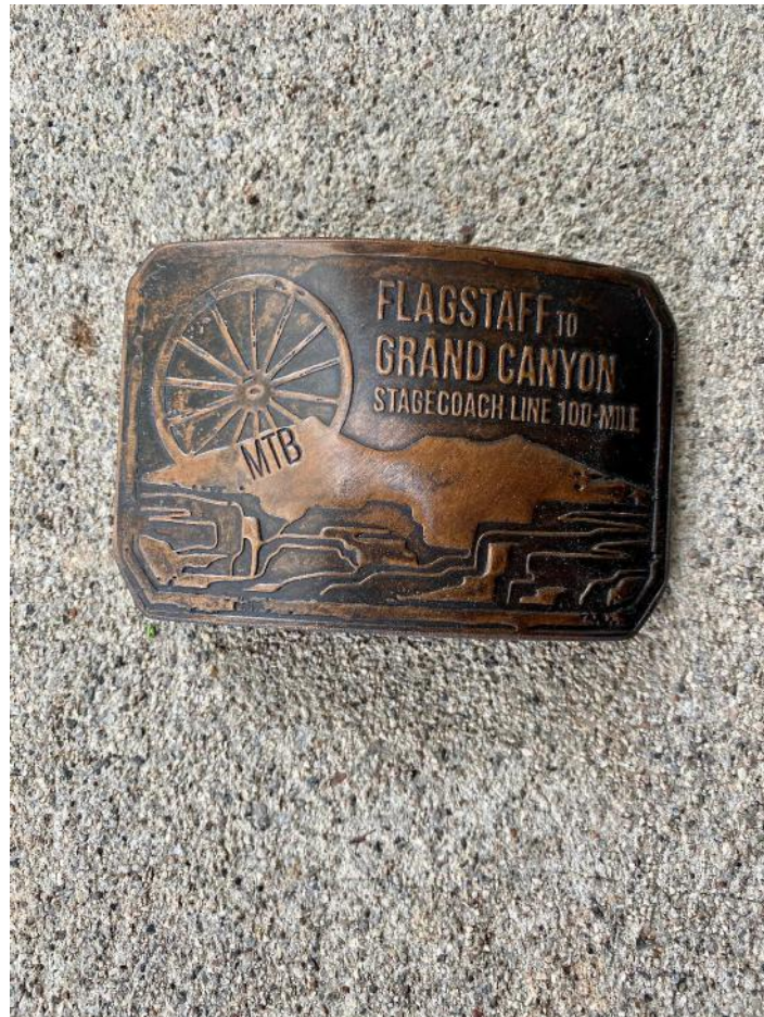
100 Mile Copper Finisher's Buckle

We'll also have other random giveaway prizes brought to you by Babbitt Ranches, Babbitt Backcountry, the Arizona Trail Association, Squirrel's Nut Butter, Absolute Bikes, Flagstaff Bicycle Revolution, and Pizzicetta.