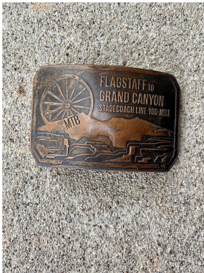
100-Mile Copper Finisher's Buckle

We'll also have other random giveaway prizes brought to you by Babbitt Ranches, Babbitt Backcountry, the Arizona Trail Association, Squirrel's Nut Butter, Absolute Bikes, Flagstaff Bicycle Revolution, and Pizzicletta.