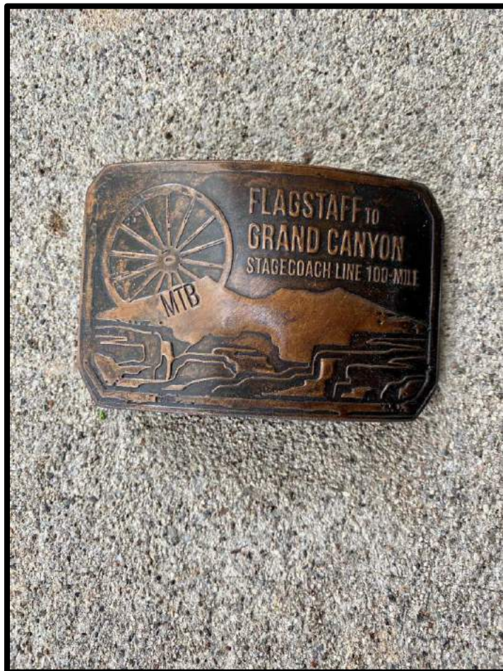
100-Mile Copper Finisher's Buckle

We'll also have other random giveaway prizes brought to you by Babbitt Ranches, Babbitt Backcountry, the Arizona Trail Association, Squirrel's Nut Butter, Absolute Bikes, Flagstaff Bicycle Revolution, and Pizzicletta.